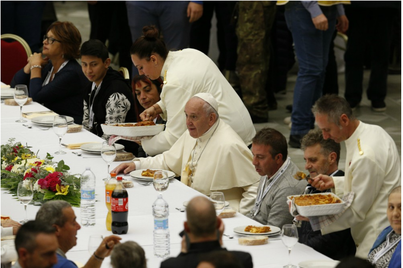
Pope Francis eats lunch with the poor in the Paul VI hall as he marks World Day of the Poor at the Vatican Nov. 17, 2019.

We got a warrior alright, but one whose priorities are a tad different from Weigel's.