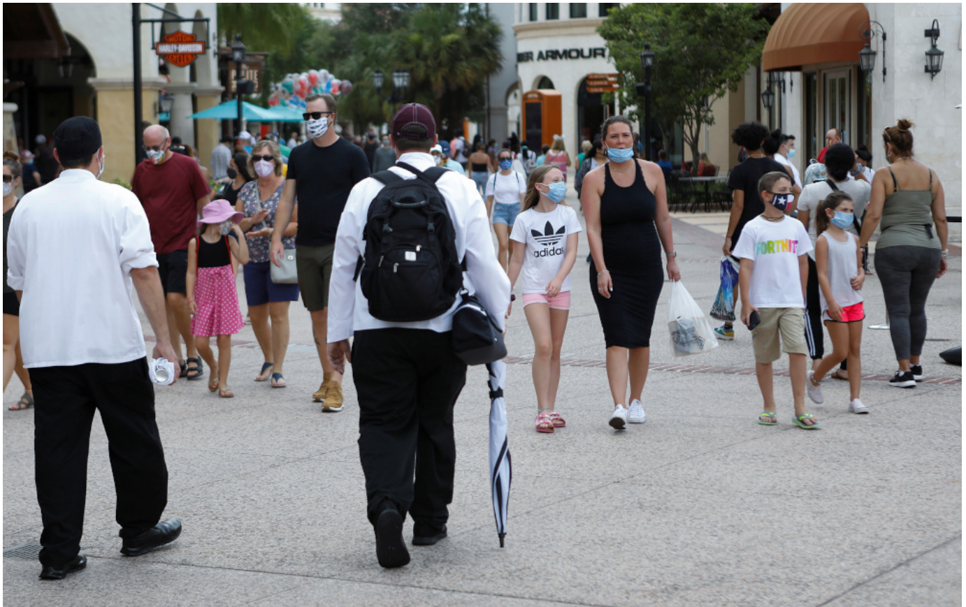
People are seen at Walt Disney World in Lake Buena Vista, Fla., July 11, 2020, during the coronavirus pandemic.

In Arizona, for example, 61% COVID-19 cases are in people under 45, public health officials said. In Texas' two largest counties, Harris and Dallas, about half of the new cases have been in people under 40.