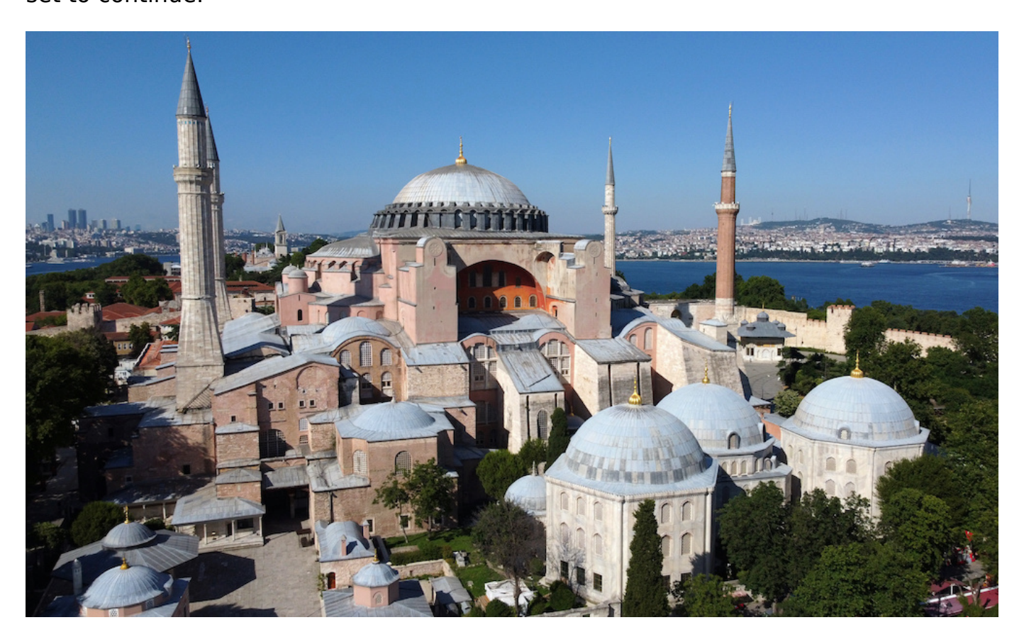
Hagia Sophia is seen in Istanbul June 30, 2020.

For now at least, the storm over this ancient Bosphorus landmark, now echoing daily with five Muslim prayer services, led by three official imams and five muezzins, looks set to continue.