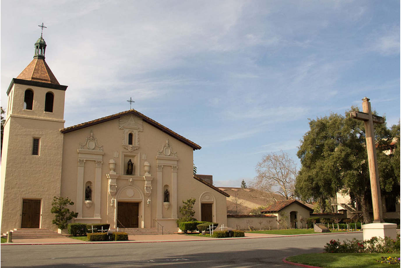
The Santa Clara Mission Church at Santa Clara University