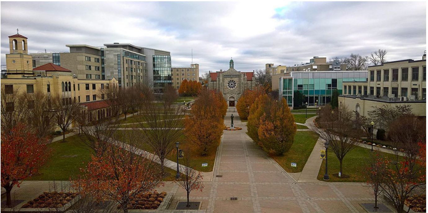
The quad at Canisius College in Buffalo, New York