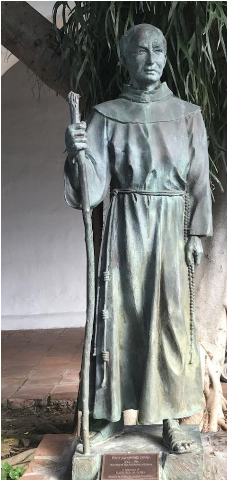
FRAY JACINTO SERRA 1713-1789 Parish of San Felipe, Monterey in memory of F. J. SERRA, B. L. S. J. O. S. F. C. S. San Francisco, California, 1961