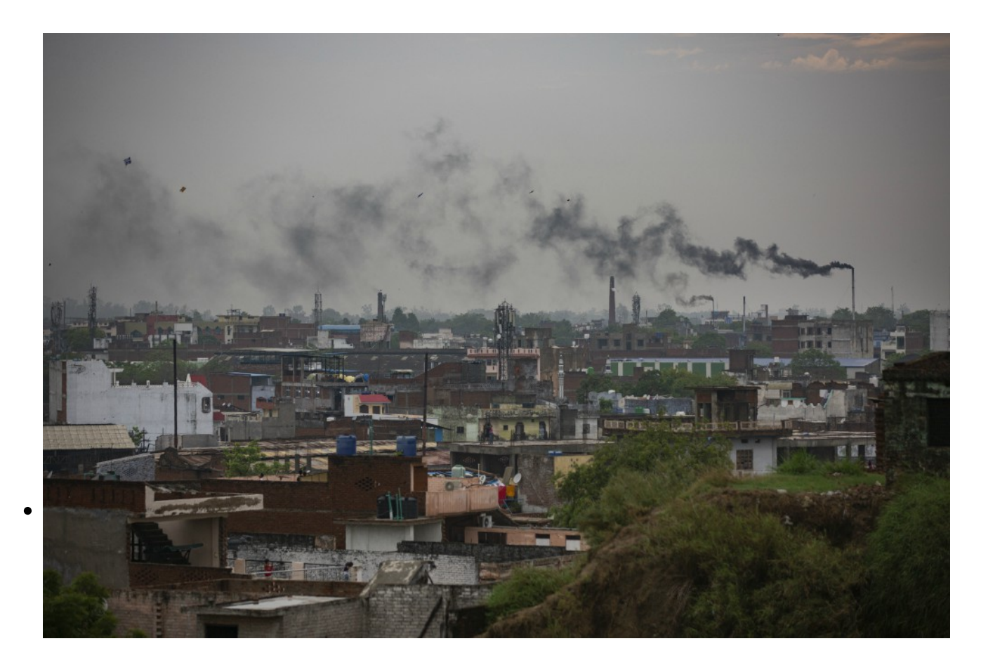
Smoke rises from chimneys of leather tanneries in Kanpur, an industrial city on the banks of the river Ganges, India, June 23.