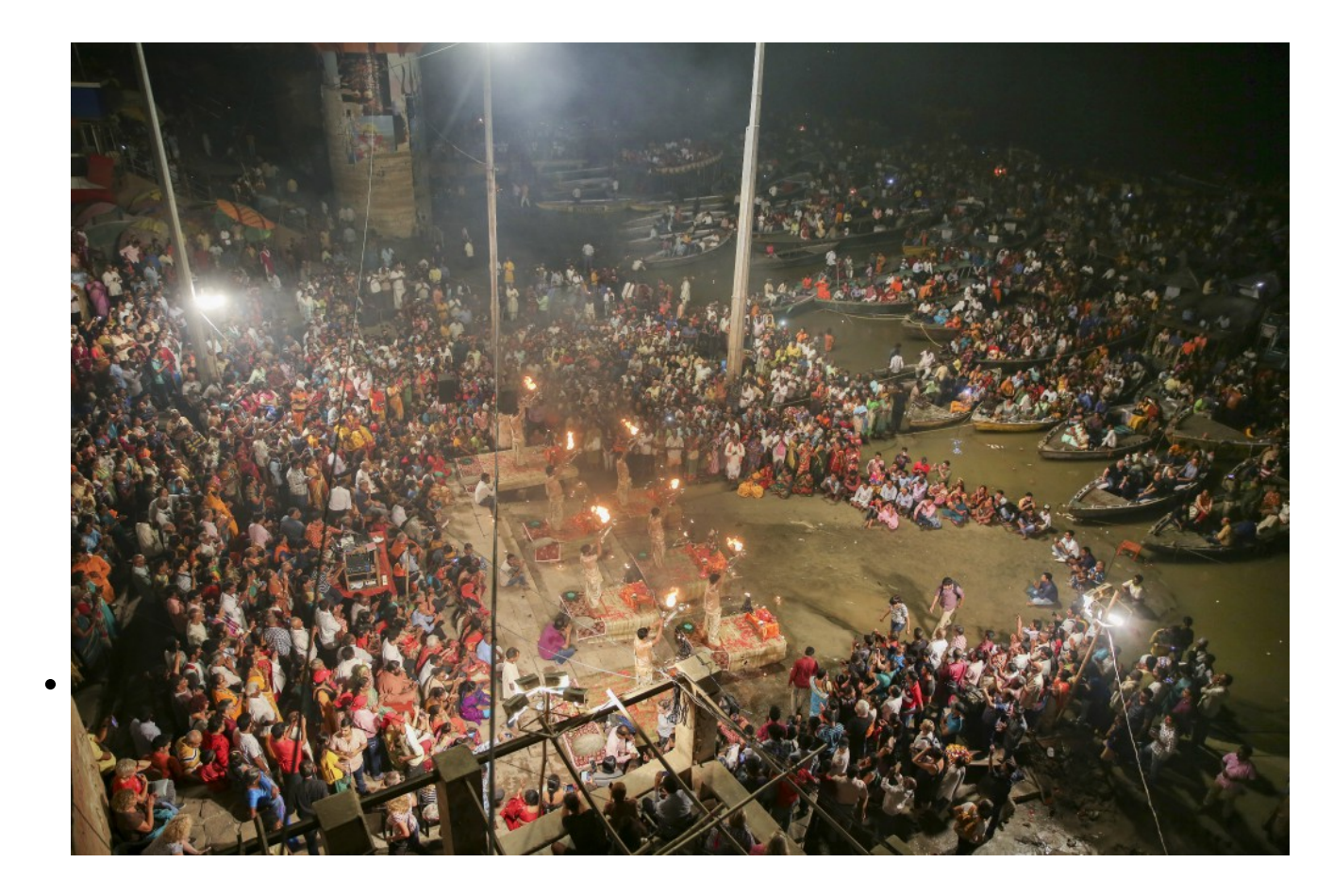
A crowd gathers for a prayer ceremony dedicated to the river Ganges in Varanasi, India, Thursday, Oct. 17, 2019.