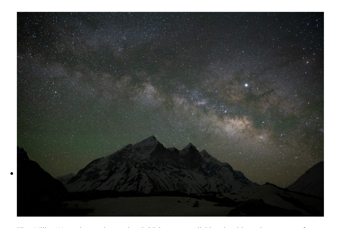
The Milky Way glows above the 6,856-meter-tall Bhagirathi peaks as seen from Tapovan, May 10, 2019. Bhagirathi peaks feed the Gangotri Glacier.