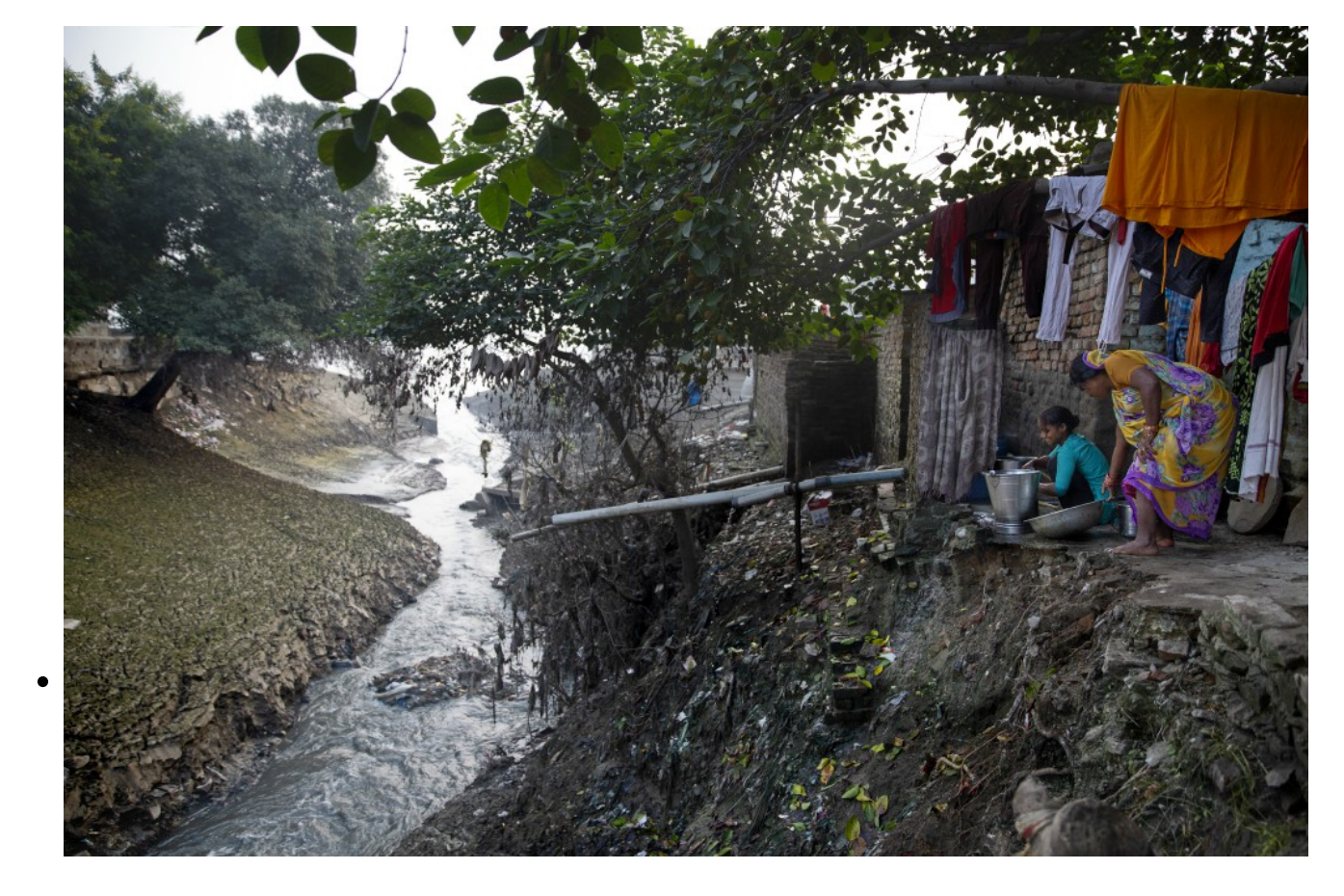
Women wash their household items by a drainage flowing into the river Ganges in Varanasi, Uttar Pradesh, Oct. 18, 2019.