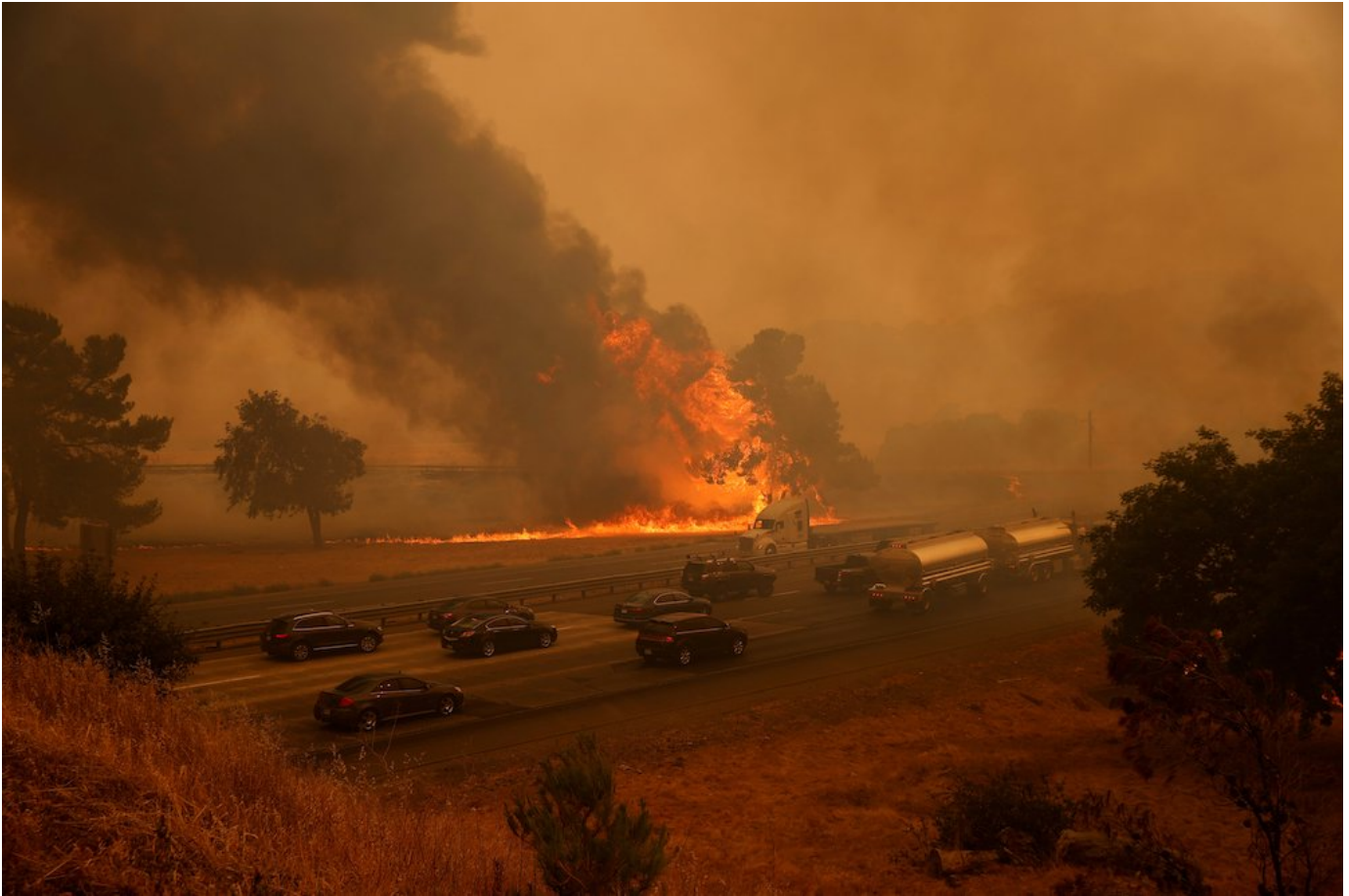
Flames from the LNU Lightning Complex Fire are seen along Interstate 80 near Vacaville, California, Aug. 19.

Biden's proposals on environmental issues, becoming bolder with his ascent to the nomination, have regularly come back to two words: jobs and justice. That focus has galvanized support from a broad coalition that includes environmental groups, unions, faith communities and people living with the daily reality of pollution in their neighborhoods.