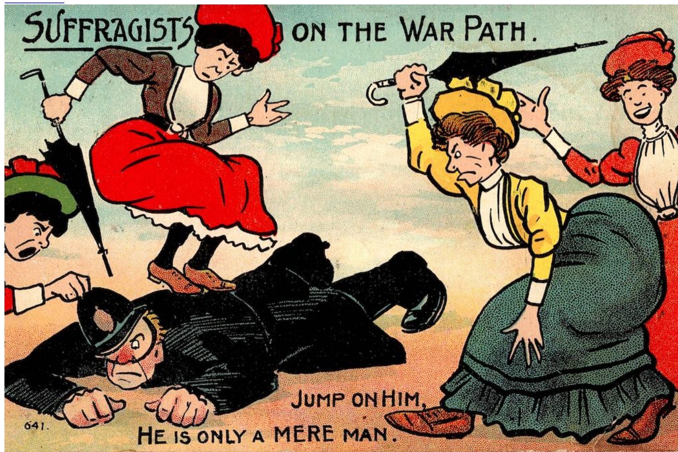
Anti-suffrage postcard