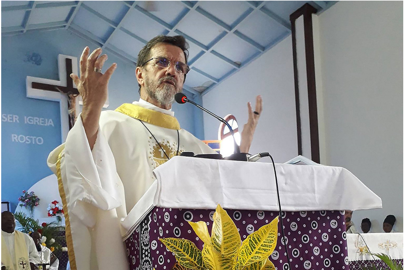
Bishop Luiz Lisboa of Pemba, Mozambique, is pictured in an undated photo.