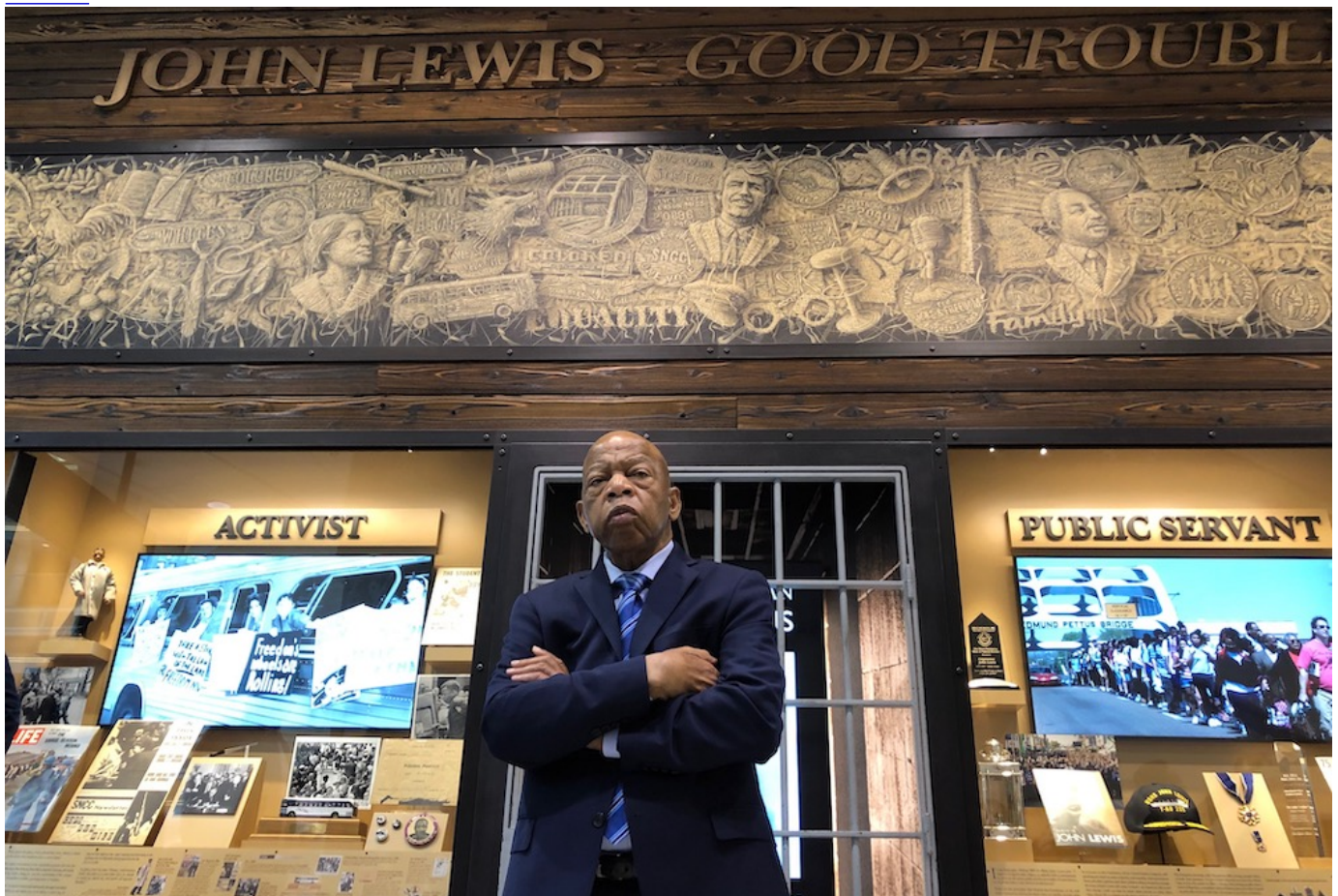
John Lewis in "John Lewis: Good Trouble," a Magnolia Pictures release.