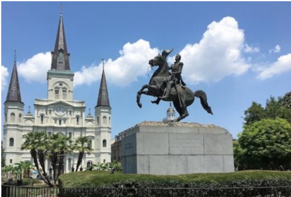
The Cathedral-Basilica of St. Louis King of France and a statue of Andrew Jackson in New Orleans June 3, 2019