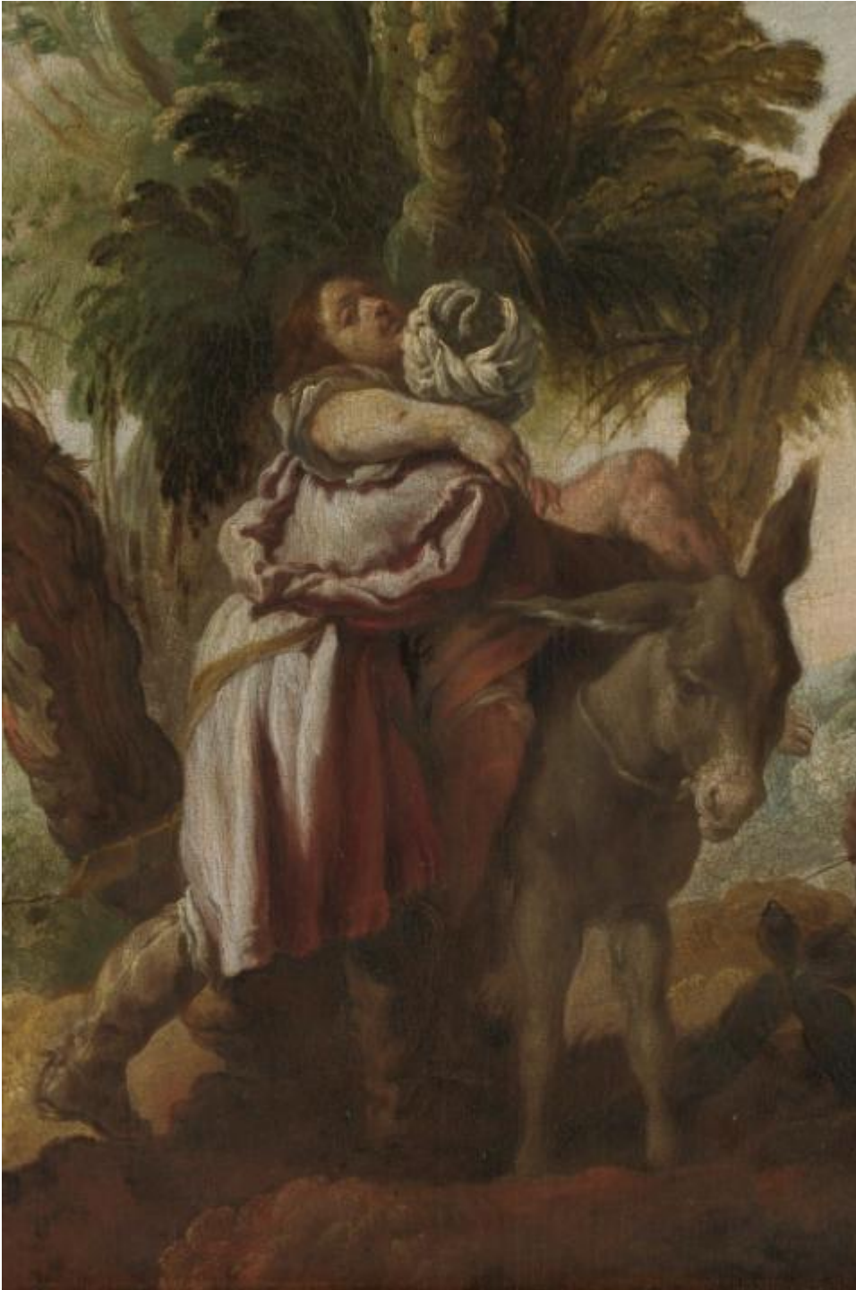
"The Good Samaritan" (circa 1618-22, detail), attributed to Domenico Fetti (Metropolitan Museum of Art)

The parable of the good Samaritan provides an alternative. It lays out clear, positive moral obligations to our neighbor, including those who, in one way or another, are