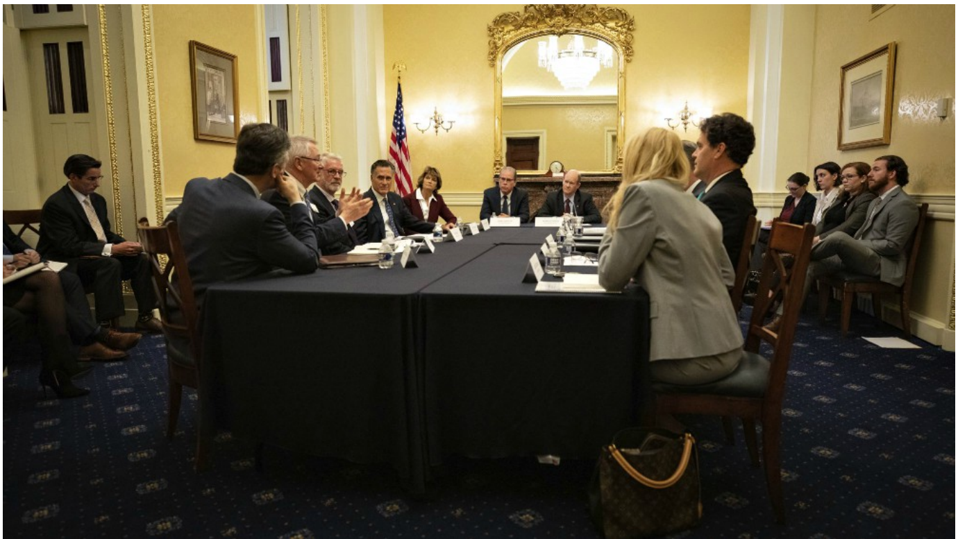
The Senate Climate Solutions Caucus meets in November 2019.

The Senate Climate Solutions Caucus formed in 2019, following the creation of a similar caucus in the House of Representatives three years earlier. The Senate version counts 14 of the 100 senators as members.