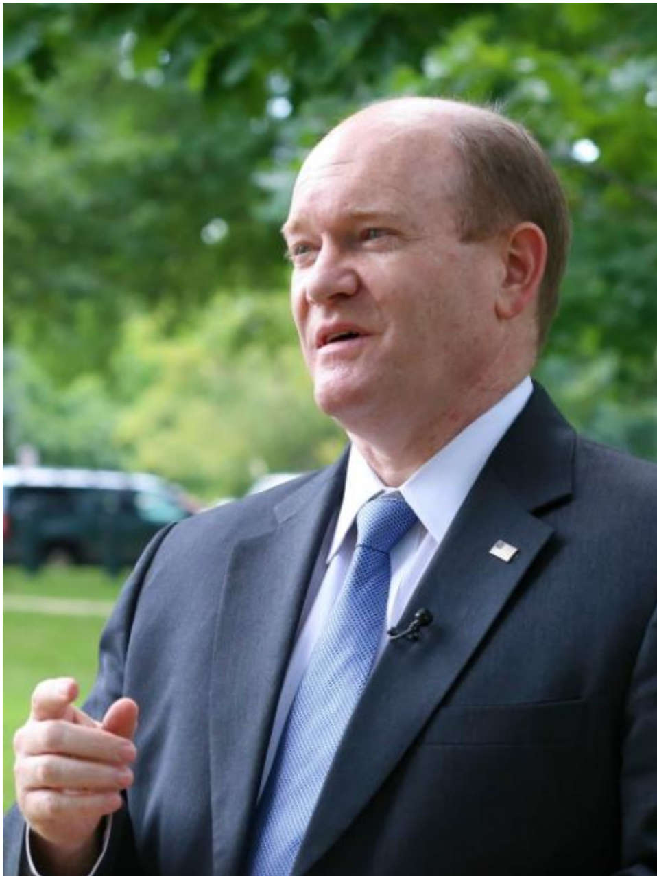
Sen. Chris Coons

Coons added that the faith community "can lift up the urgency" of the long-term consequences of climate change, "which is imminent and present in the experiences of so many around the world here in the short term, as well."