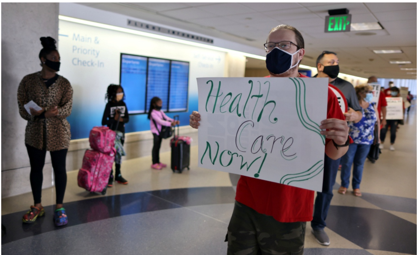
A person holds a sign as laid off LAX Airport workers protest for an extension of health care benefits by concessions companies in Los Angeles Sept. 24.

Trump also appoints anti-labor judges. Justice Neil Gorsuch and Justice Brett Kavanaugh have authored opinions that favor of corporations and undercut workers' rights. Legal and labor experts are decrying prospective U.S. Supreme Court justice Amy Coney Barrett's past rulings against workers and her potential to vote against the Affordable Care Act given her past criticism of it.