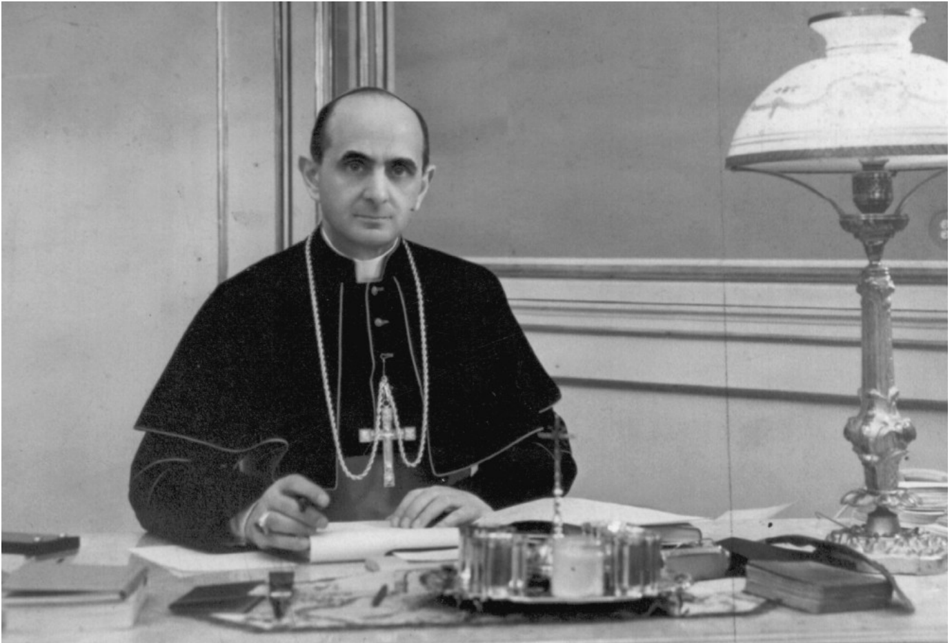
Cardinal Giovanni Battista Montini, who became Pope Paul VI