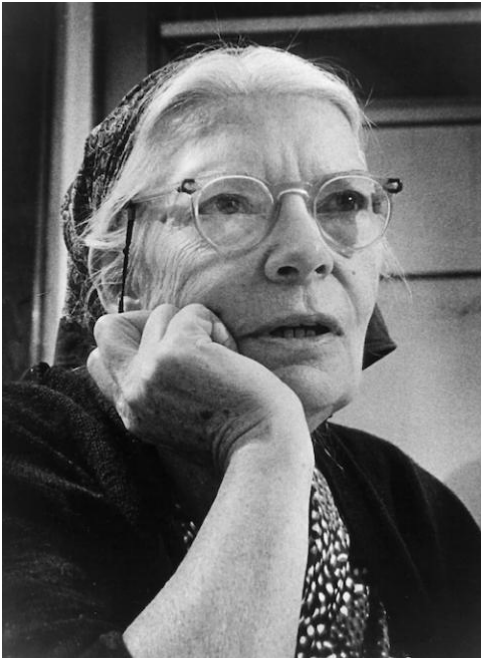
Dorothy Day, co-founder of the Catholic Worker movement, pictured in an undated photo

Soon the God-haunted Dorothy was herself baptized, having solicited the help of a local nun and four priests she had met in New York and on Staten Island. The priests treated her compassionately, encouraging her to continue to work as a freelance journalist to support her family. For the good of her daughter, they advised her not to forsake her common-law marriage. Who knows what would have become of convert Dorothy had she met a stricter band of clerics