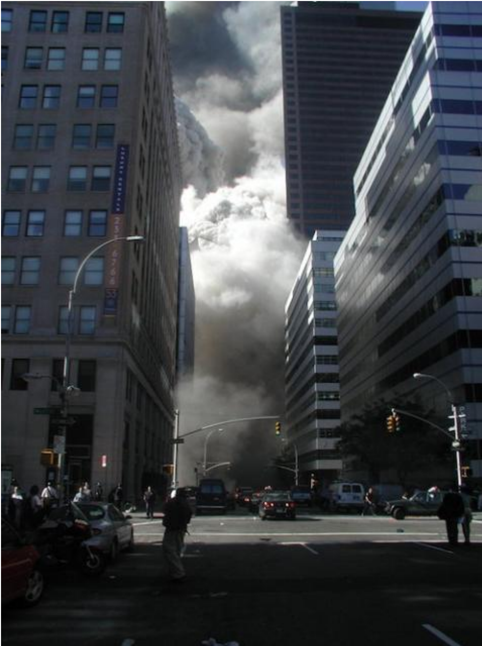
A cloud of dust and smoke is seen through the buildings along West Broadway in New York City, after the collapse of World Trade Center 2 on Sept. 11, 2001.