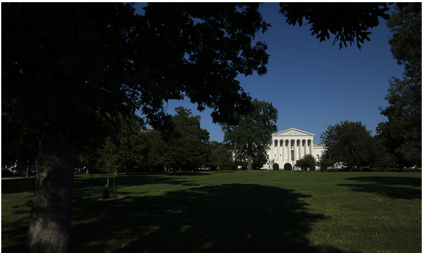
The U.S. Supreme Court in Washington, D.C.