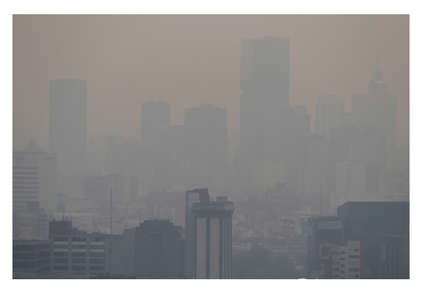
Mexico City is shrouded in smog in May 2019.

She urged countries that are pumping billions of dollars into their economies to boost recovery to also fulfill their pledges to the Green Climate Fund, which has fallen fall short of its goal of delivering $100 billion annually to developing countries by this year.