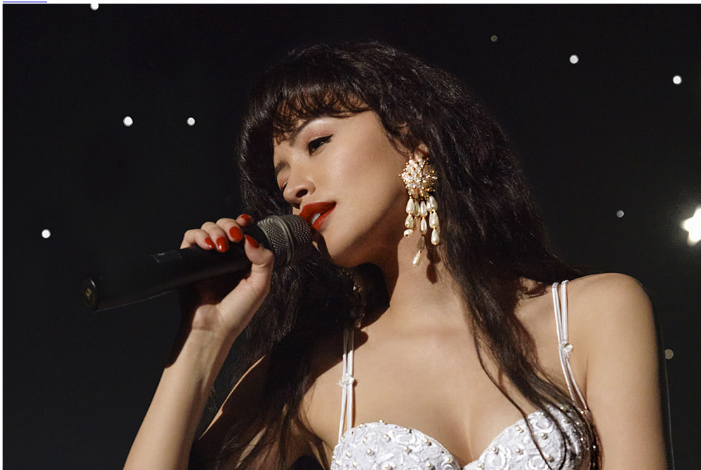
Christian Serratos as Selena Quintanilla in "Selena: The Series"