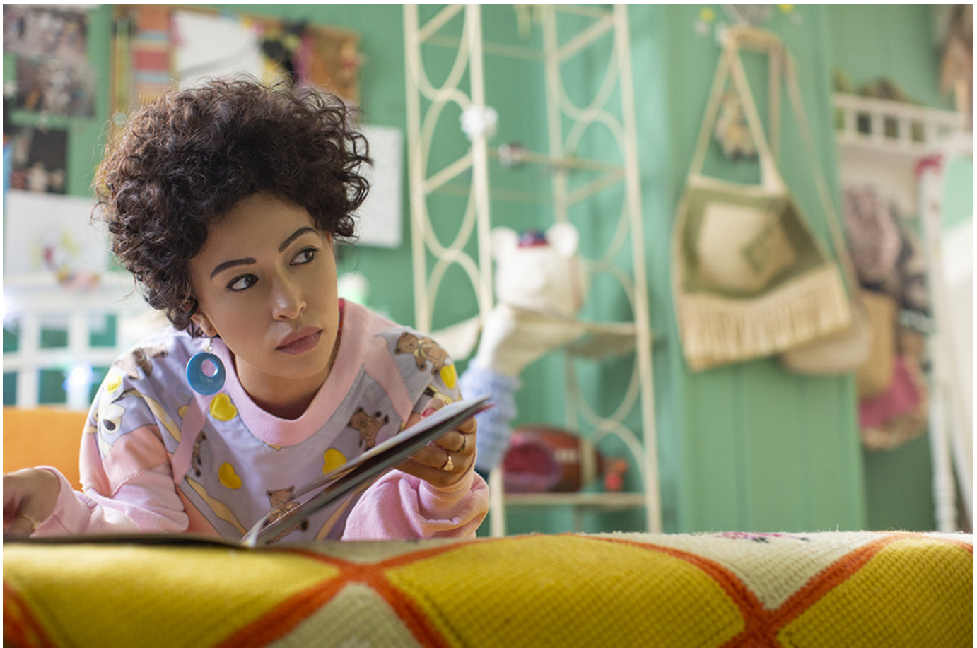
Christian Serratos as Selena Quintanilla in "Selena: The Series"

It's a heartbreaking moment, but it doesn't reek of foreshadowing. The series focuses on the minutiae of family life, the memories the Quintanillas might treasure even more than those when they shared their daughter and sister with the rest of the world.