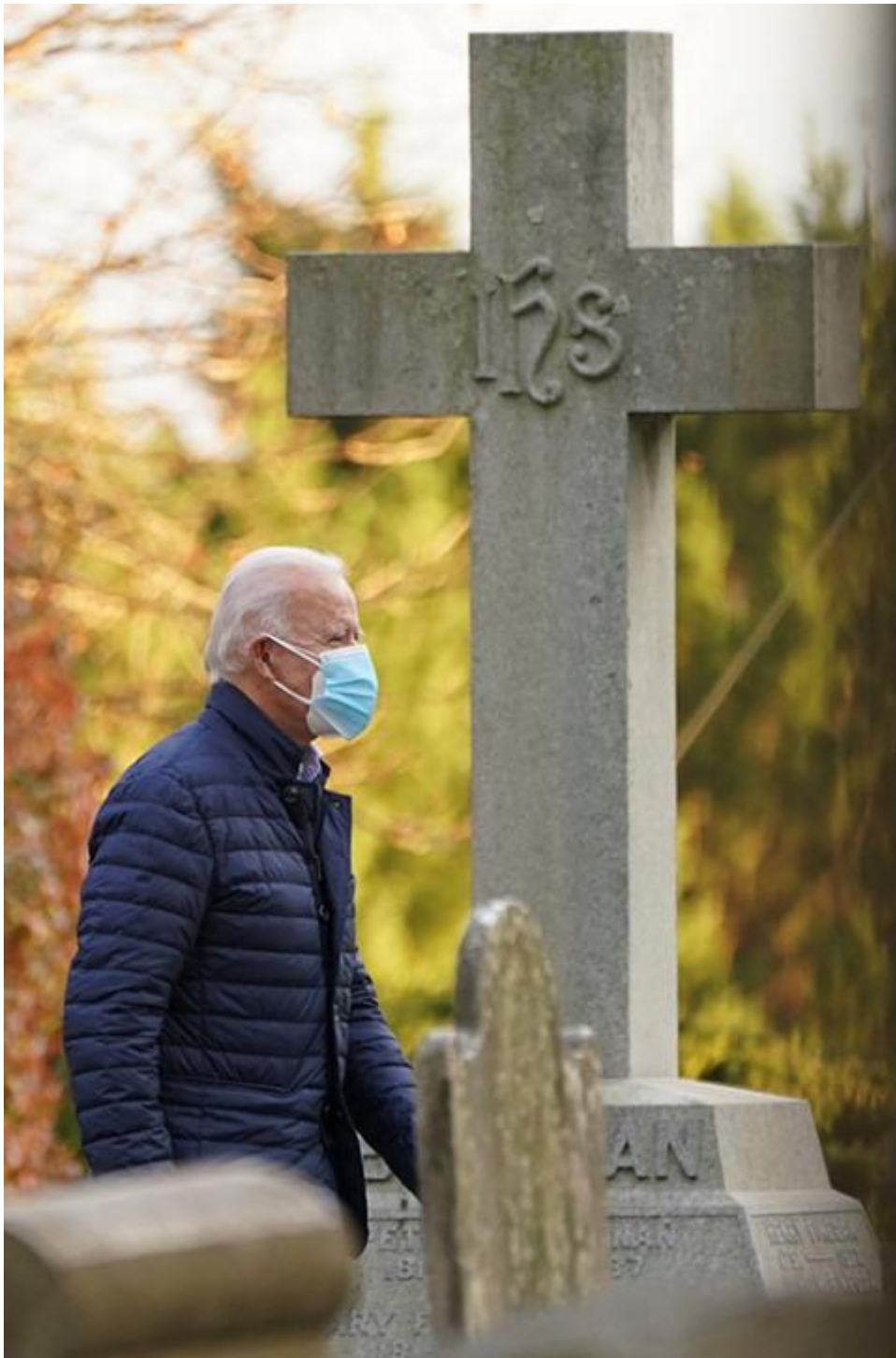
President-elect Joe Biden arrives to attend Mass in Wilmington, Delaware, Dec. 5.

Biden's faith clearly has had an impact on his greatest political gift, that of public empathy, weaving his own struggles of the deaths of his children and first wife with the stories of public loss from pandemic or violent mass killings. It is no small thing. Think of what we haven't had for the past four years. We will now have a gifted