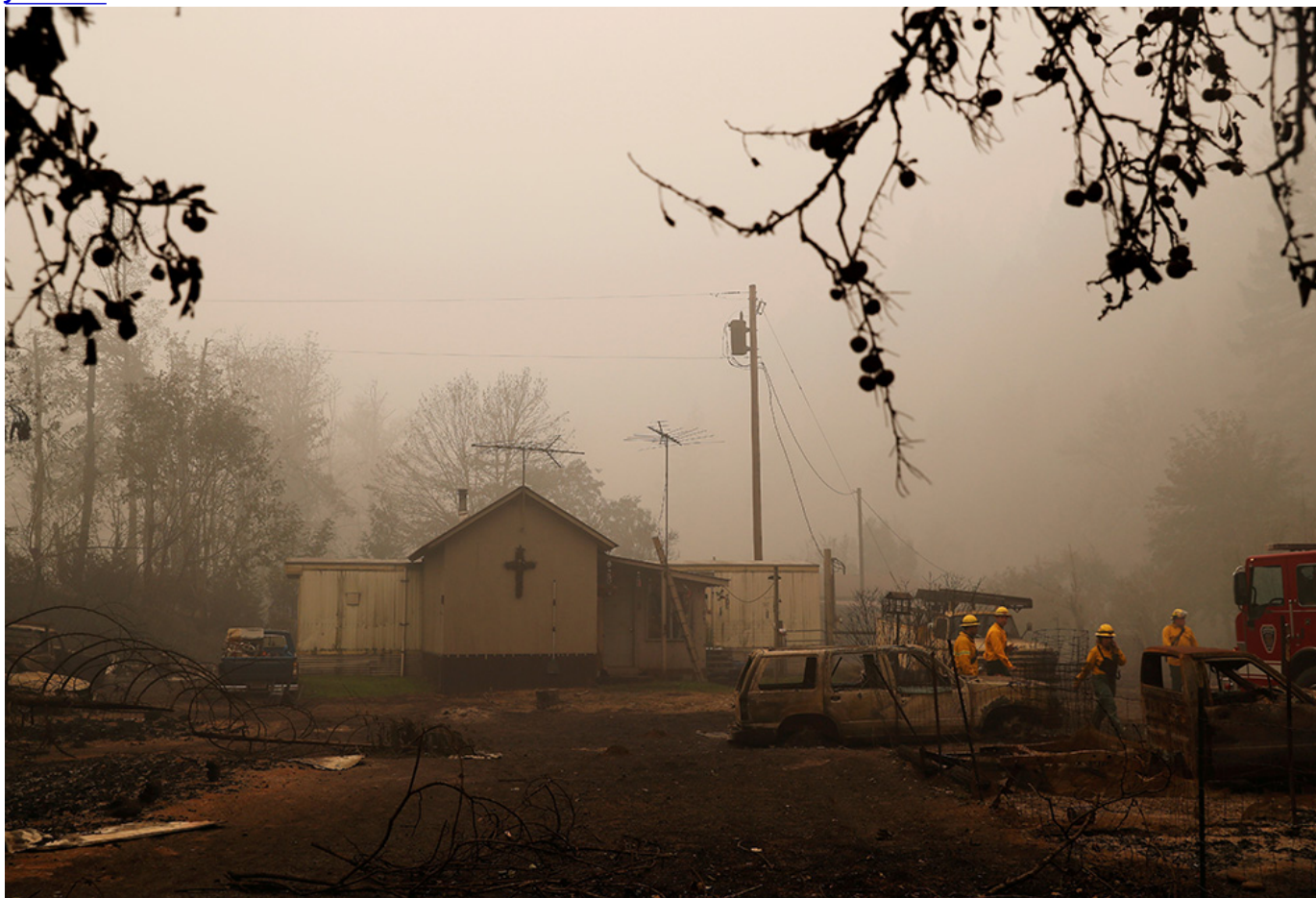
Firefighters in Detroit, Oregon, assess wildfire damage to a church Sept. 14, 2020, in the aftermath of the Beachie Creek Fire.