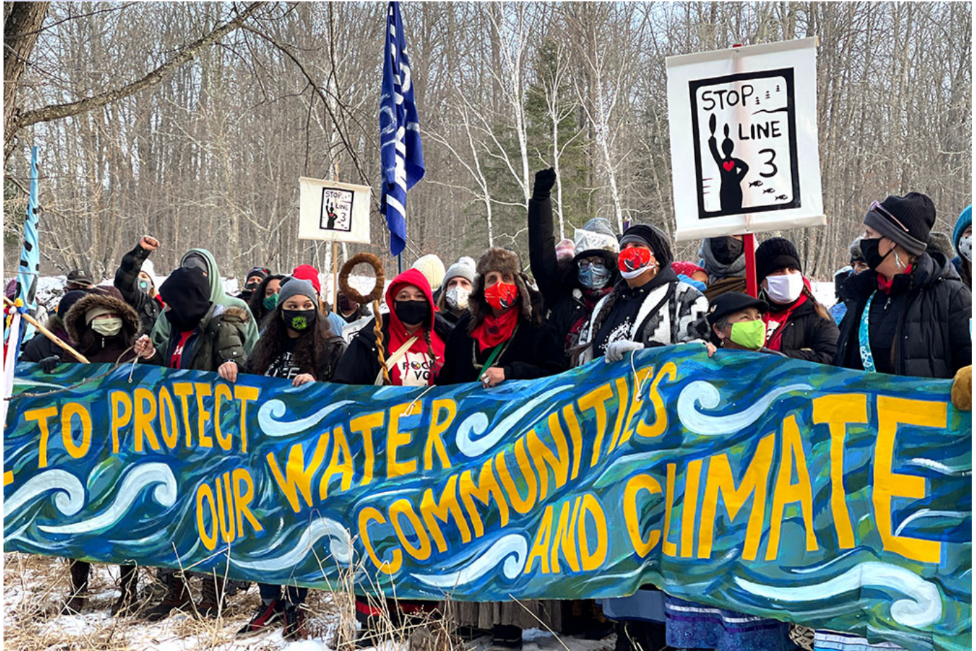
Protesters demonstrate against the Enbridge Line 3 Pipeline in northwestern Minnesota on Dec. 17, 2020.