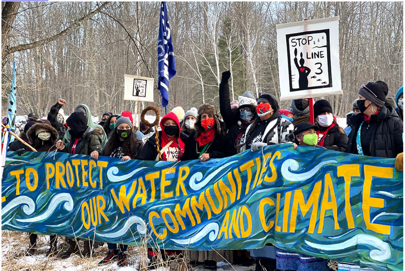
Protesters demonstrate against the Enbridge Line 3 Pipeline in northwestern Minnesota on Dec. 17, 2020.