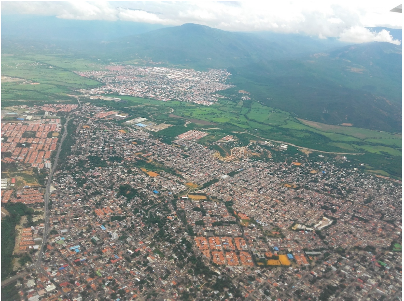
The Colombia-Venezuela border at Cúcuta

Unemployment in Cúcuta reached 25% at the end of 2020, and informal, unstable work arrangements are dominant in the city's labor market. The pandemic has further intensified the social crisis.