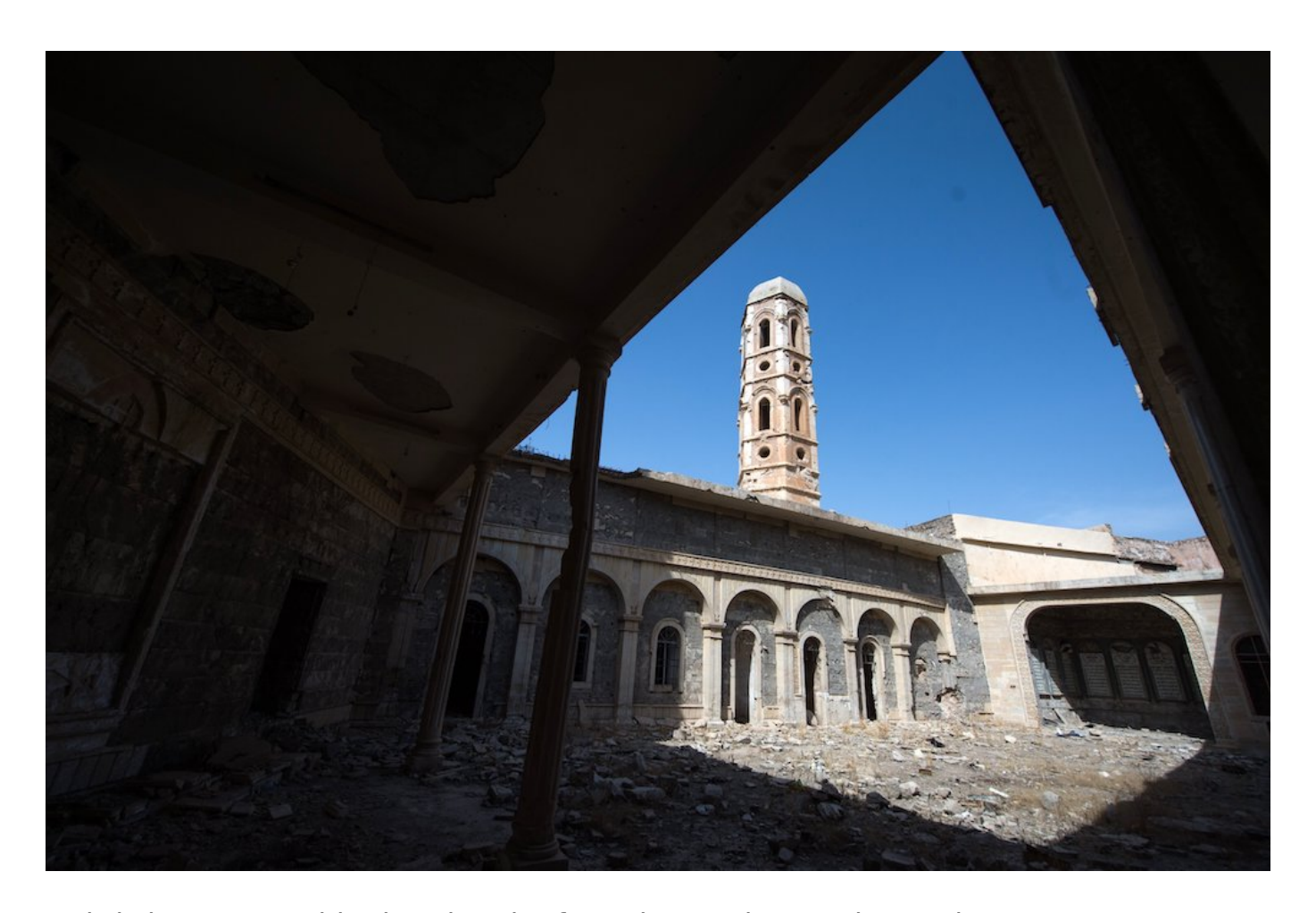
Debris is seen outside the Church of St. Thomas in Mosul, Iraq, in June 2019.