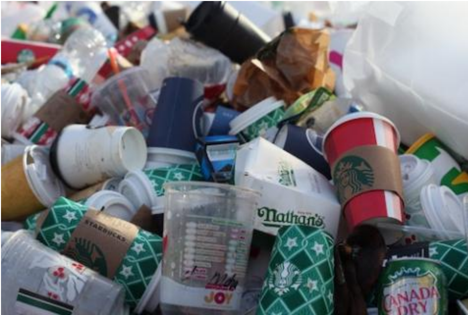
Pile of discarded single use containers, mostly coffee cups

"It's not enough to just talk about the principles. There have to be strategies and campaigns and movements to enact and operationalize those," he said.