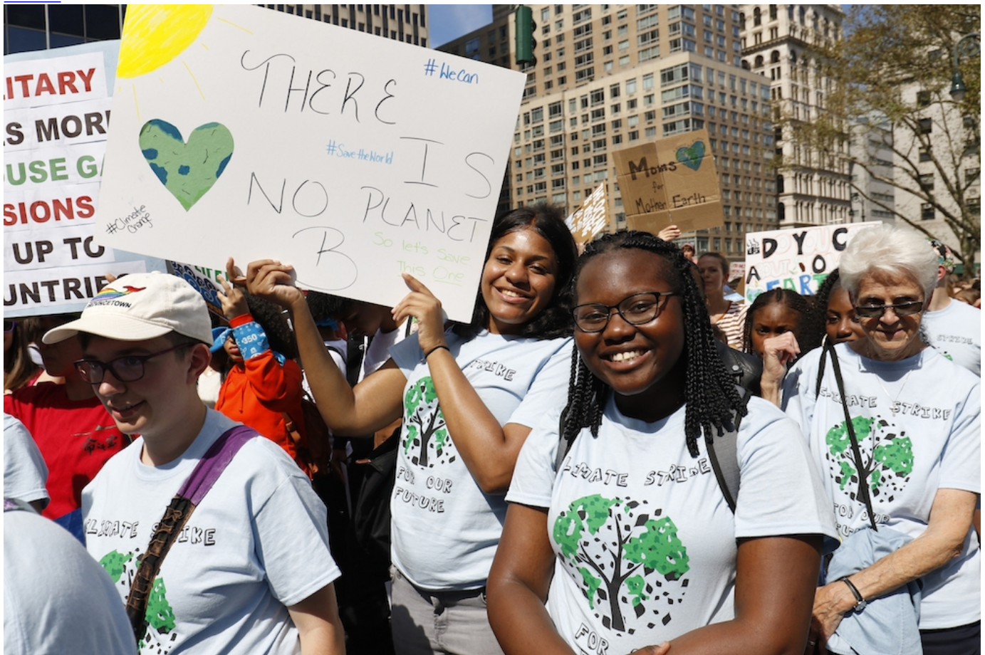
Students from St. Joseph High School in Brooklyn, New York, participate in the Global Climate Strike in New York City Sept. 20, 2019.