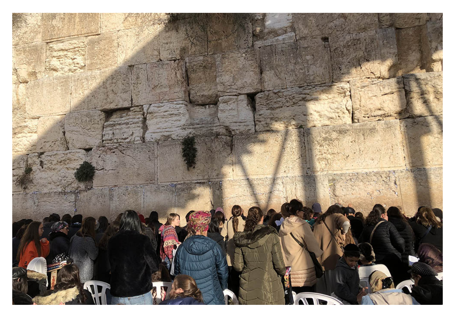
Pilgrims in the women's section at the Western Wall in December 2019

It was the memory of seeing the expanse of the former Temple of Jesus' times, the excavations below revealing ancient streets where Jesus may have walked, and praying at the Western Wall that connected with me during the Gospel reading on Palm Sunday.