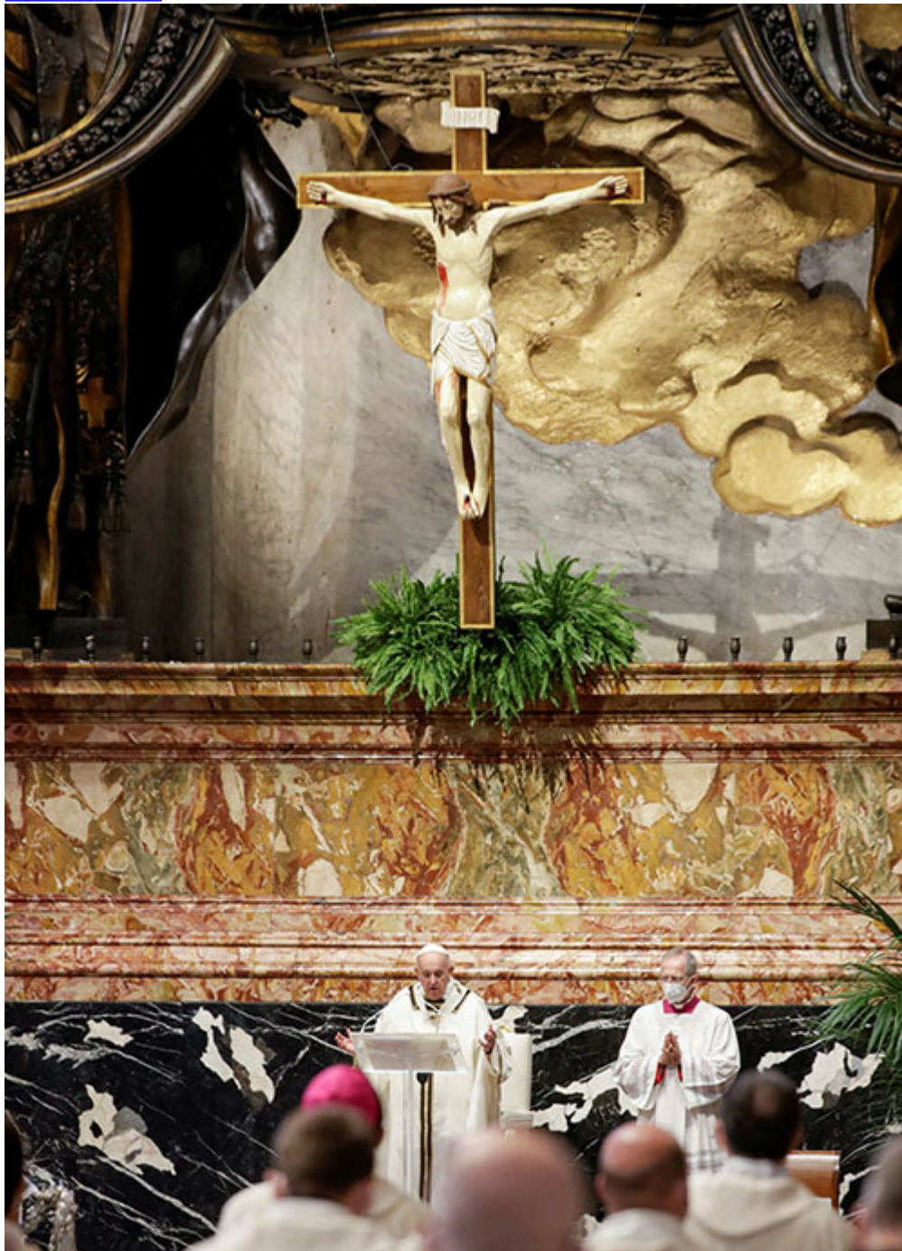
Pope Francis gives the homily as he celebrates Holy Thursday chism Mass in St. Peter's Basilica at the Vatican April 1, 2021.