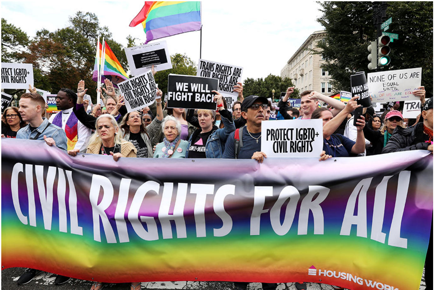
LGBTQ activists are seen outside the Supreme Court Oct. 8, 2019, in Washington.