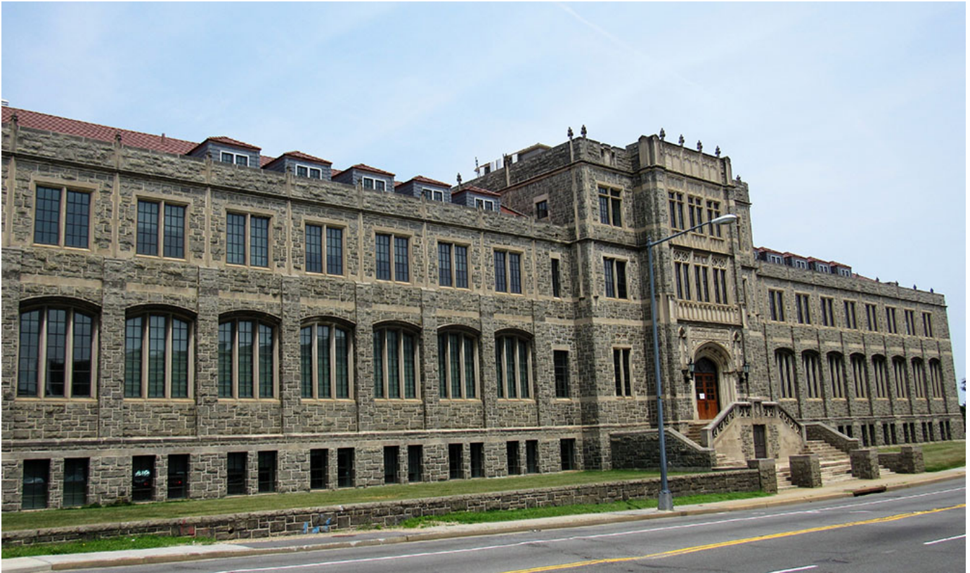
Maloney Hall, home of the Busch School of Business at the Catholic University of America in Washington, D.C.