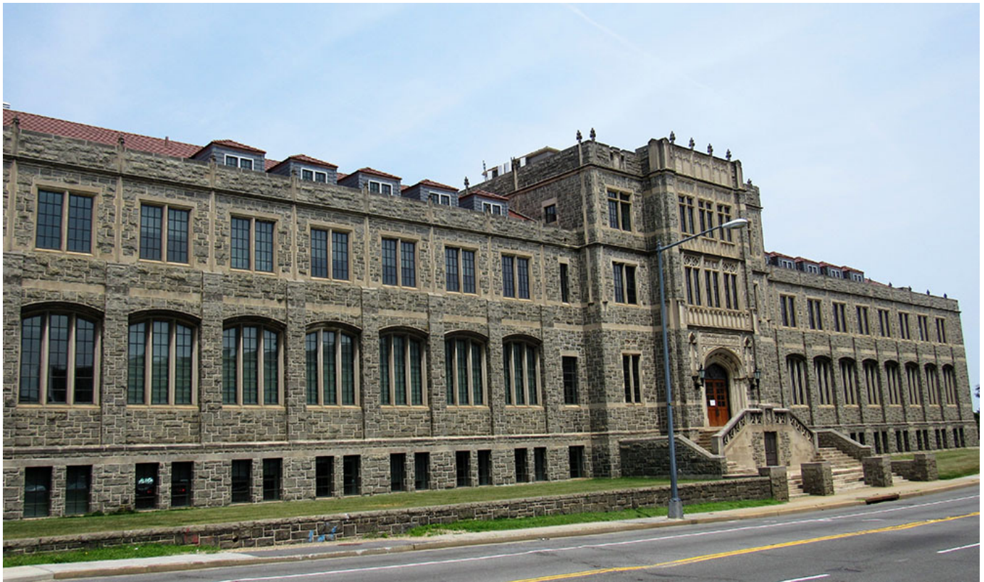
Maloney Hall, home of the Busch School of Business at the Catholic University of America in Washington, D.C.