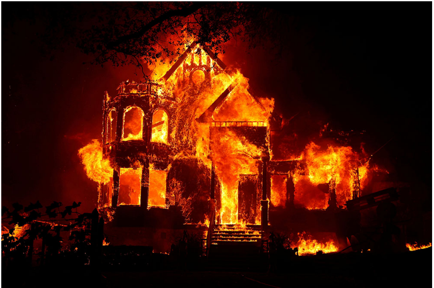
A home is seen fully engulfed in flames during the Glass Fire in St. Helena, California, Sept. 27, 2020.