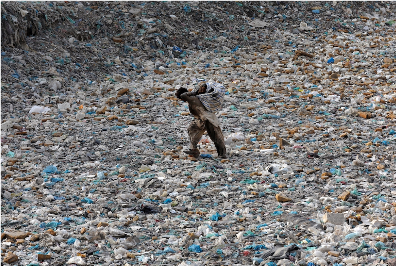
A boy carrying a sack of recyclables walks through trash in Karachi, Pakistan, June 4, 2020.