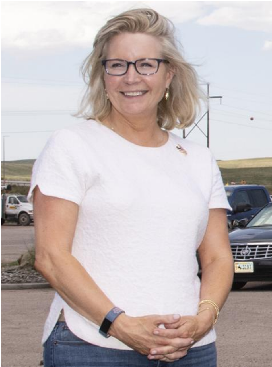
US Rep. Liz Cheney is pictured in a 2019 photo

The analogy works but, like all analogies, it is not exhaustive. For example, it is true that Trump expects obedience to a degree unheard of in American presidential politics, but far more akin to the obedience medieval popes expected when supplicants kissed their ring or their foot. On the other hand, the analogy fails because spiritual regeneration sometimes flowers in the face of political oppression, while I can think of no instance in human history when the political life of a democratic nation flourished when overwhelmed by policies and politics driven by personal or dynastic agendas.