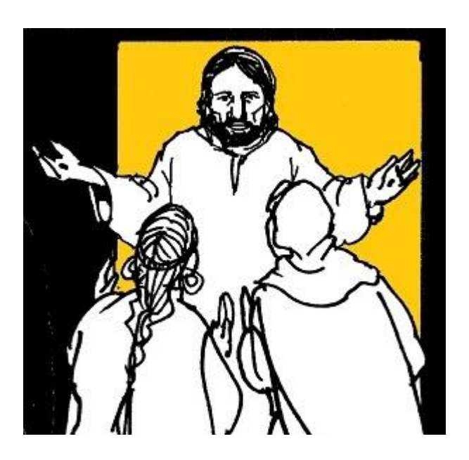
"I have called you friends" (John 15:15).