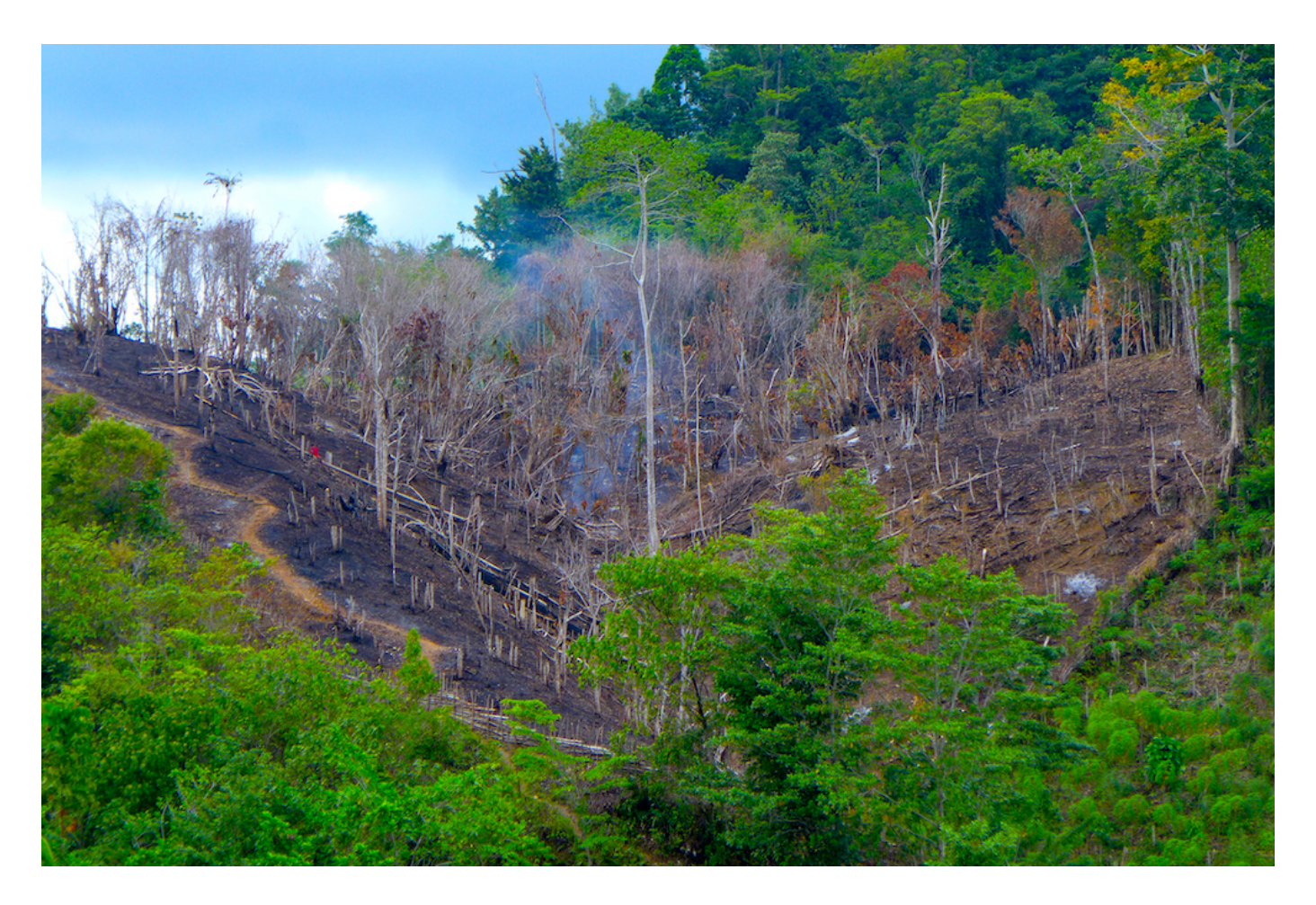
Deforestation in West Papua, Indonesia, in 2014