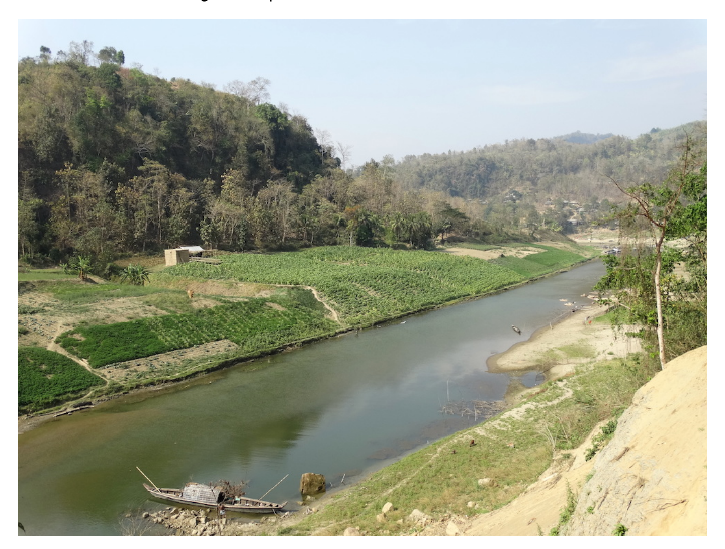
Ruma Bazar, Chittagong Hill Tracts, Bangladesh, in 2014

People worry that the projects will affect forests, water supplies, biodiversity and sacred sites. Women will suffer most, because of loss of access to water and to food from the forest, she said. Women are also the targets of violence, including sexual violence, in areas being developed for tourism.