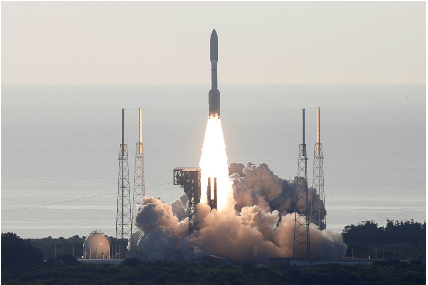
A United Launch Alliance Atlas V rocket carrying NASA's Mars "Perseverance" rover vehicle takes off from Cape Canaveral Space Force Station in Cape Canaveral, Florida, in this July 30, 2020, file photo.

My youthful diet of science fiction eventually posed other questions. Is there intelligent life on other planets? If so, do they have souls? Did Christ's dying and rising save them too? Might they have a religion? Do they have sacred texts that tell fanciful stories about their origins?