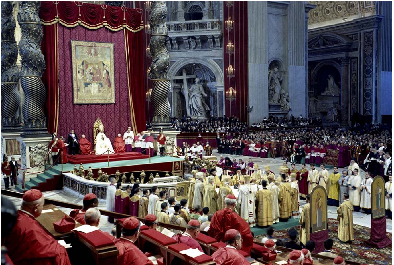
Pope Paul VI presides over a meeting of the Second Vatican Council in St. Peter's Basilica at the Vatican in 1963.

The history of the magisterium teaches us that not all changes are ruptures, and not all material continuities with the previous tradition ensure continuity with the Gospel. It is also misleading to say that "the same magisterium that gave us the ecumenical council of Vatican II also gave us Pope Benedict XVI's motu proprio [ Summorum Pontificum on the 'traditional Latin Mass']," almost implying that the teaching of a general council like Vatican II and the motu proprio of a pope are on the same level of authority.