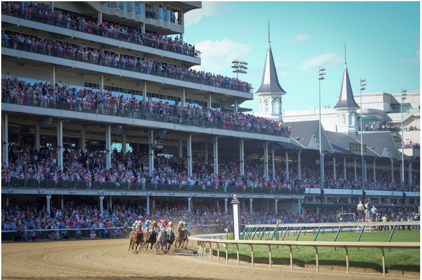
Crowds cheer as the field of horses round turn one at Churchill Downs April 30, 2021, during the Kentucky Oaks race a day before the 147th running of the Kentucky Derby.

New Hampshire's initiative began to shift toward acceptance of a tactic still widely thought shady but appealing as a cheap revenue-raiser that could reduce citizens' own taxes. At any rate, increasing acceptance of that basic formula triggered a string of similar state-run lotto campaigns with winning tickets drawn on television. The proliferation of gambling styles has made quips such as "when I win the lottery" part of the language and renders the moral qualms from my boyhood quite laughable. The buying of lottery tickets, a night at the riverboat casino, joining the weekly office pool, clicking onto an internet card game have become normal routines, among others, virtually without stigma. It's the way we choose to live now. Casinos have mushroomed across the country, numbering over 1,000 , closely divided between those that are commercially and tribally owned.