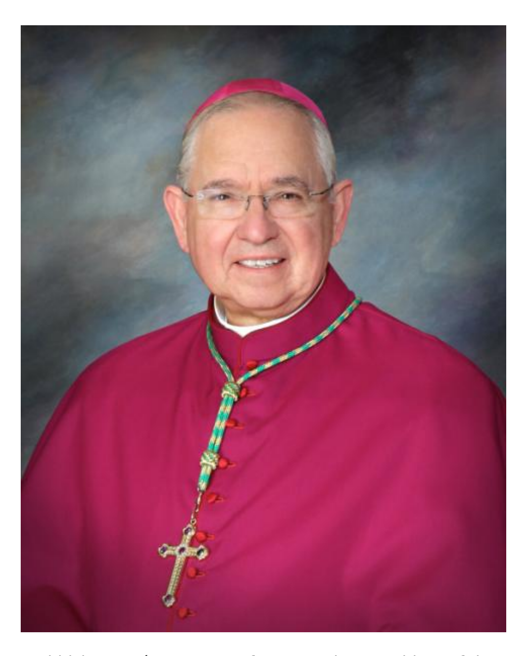
Archbishop José H. Gomez of Los Angeles, president of the U.S. Conference of Catholic Bishops, is seen in this Nov. 20, 2019, file photo.

After receiving an unprecedented letter from 67 bishops appealing for a delay in a discussion during the bishops' upcoming spring general assembly on whether to prepare a teaching document on the reception of Communion, the U.S. Conference of Catholic Bishops' president explained in a memo the procedure followed in bringing the question to a vote during the June 16-18 virtual meeting.