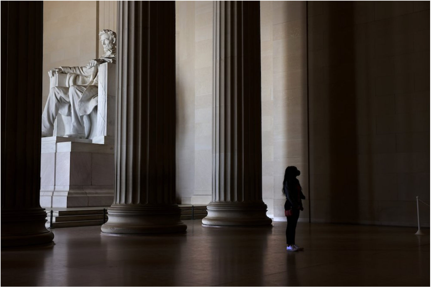
A visitor in the Lincoln Memorial in Washington April 21, 2021