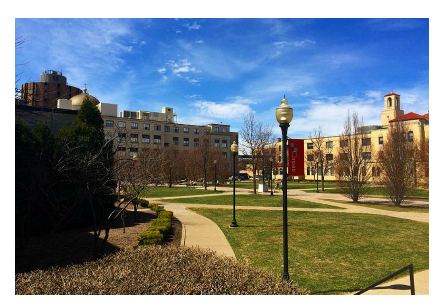
Quadrangle of Canisius College, Buffalo, New York

Working group members were required to keep information confidential, the report said. "As a result, the faculty did not have the information or opportunity to assess fully the twin claims that Canisius faced a massive budget shortfall and that this shortfall could be resolved only by discontinuing programs and terminating tenured faculty appointments," the report stated.