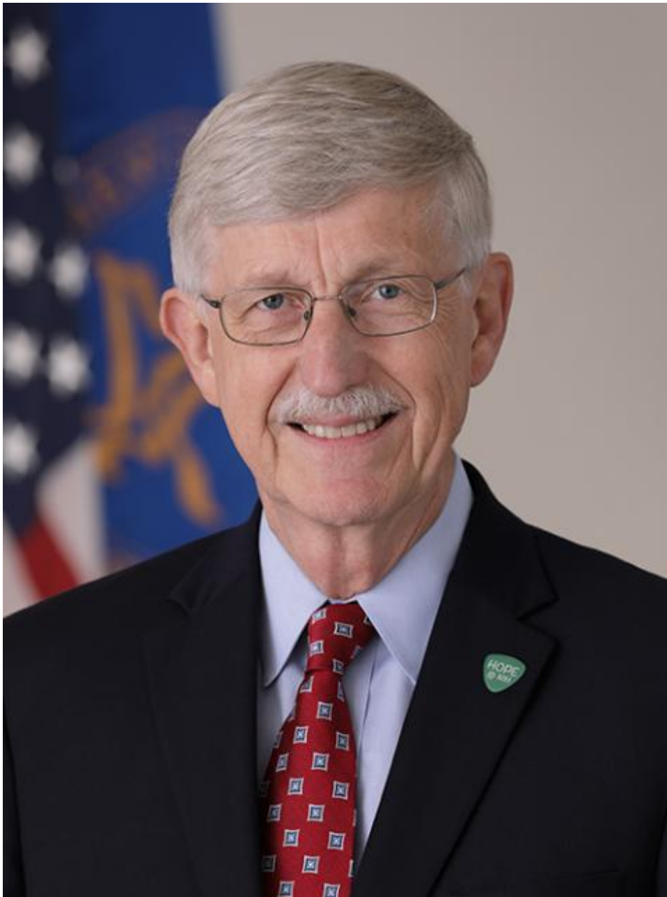
Dr. Francis Collins

"As a person of faith myself, as well as a scientist, I've been spending a fair amount of my time talking with faith leaders, encouraging them to see themselves as really important voices," he said. "People are looking for credible spokespeople who they think have their best interest at heart to give them some guidance about this."