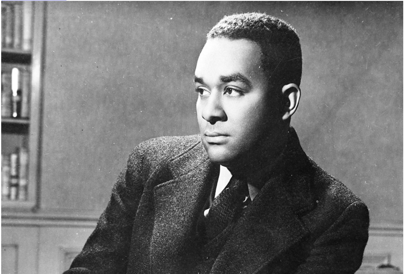
Novelist Richard Wright, circa 1935-42