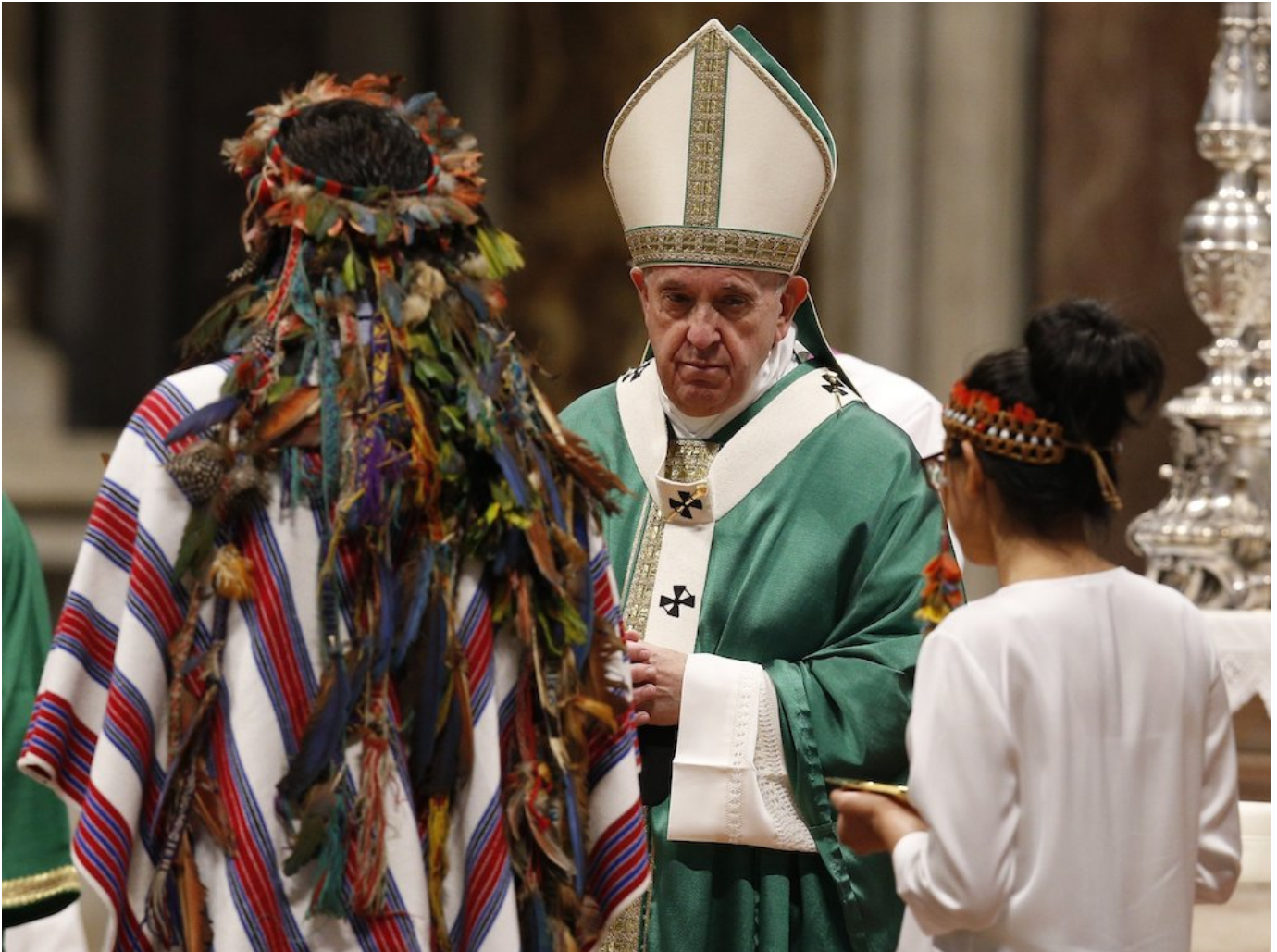
Pope Francis accepts offertory gifts from Indigenous people as he celebrates the concluding Mass of the Synod of Bishops for the Amazon at the Vatican on Oct. 27, 2019.