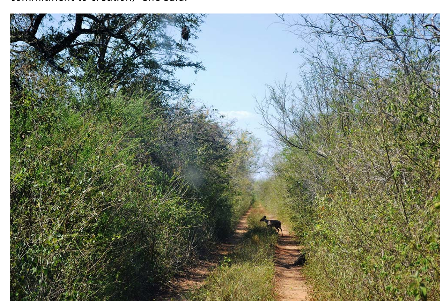
Kaa-Iya del Gran Chaco National Park and Integrated Management Natural Area in Bolivia

"Most Catholics don't understand exactly what 'integral ecology' means. They think it's about planting trees. But it's not something secondary; it's an integral part of our commitment to creation," she said.