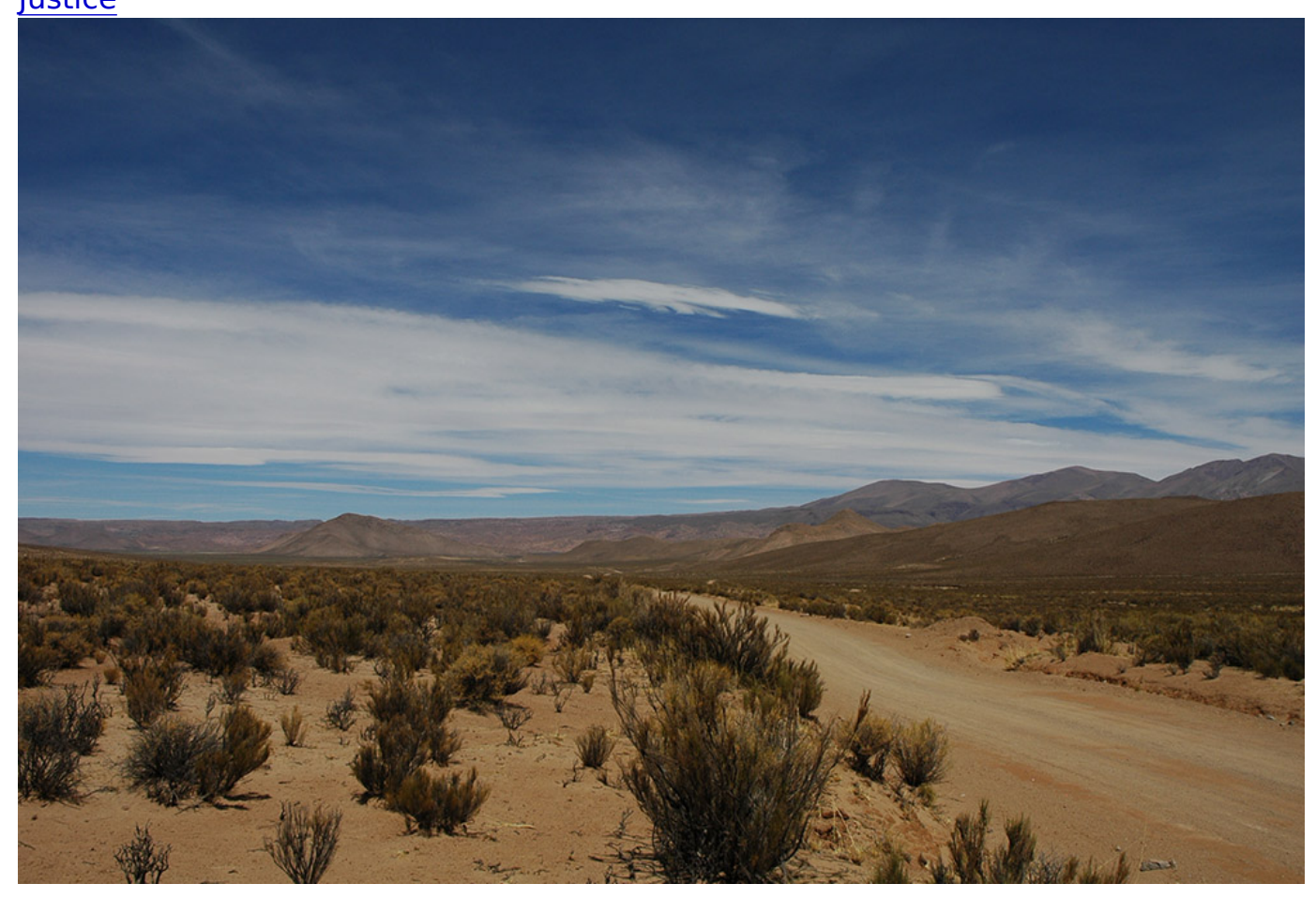
A Gran Chaco landscape in Jujuy Province, Argentina