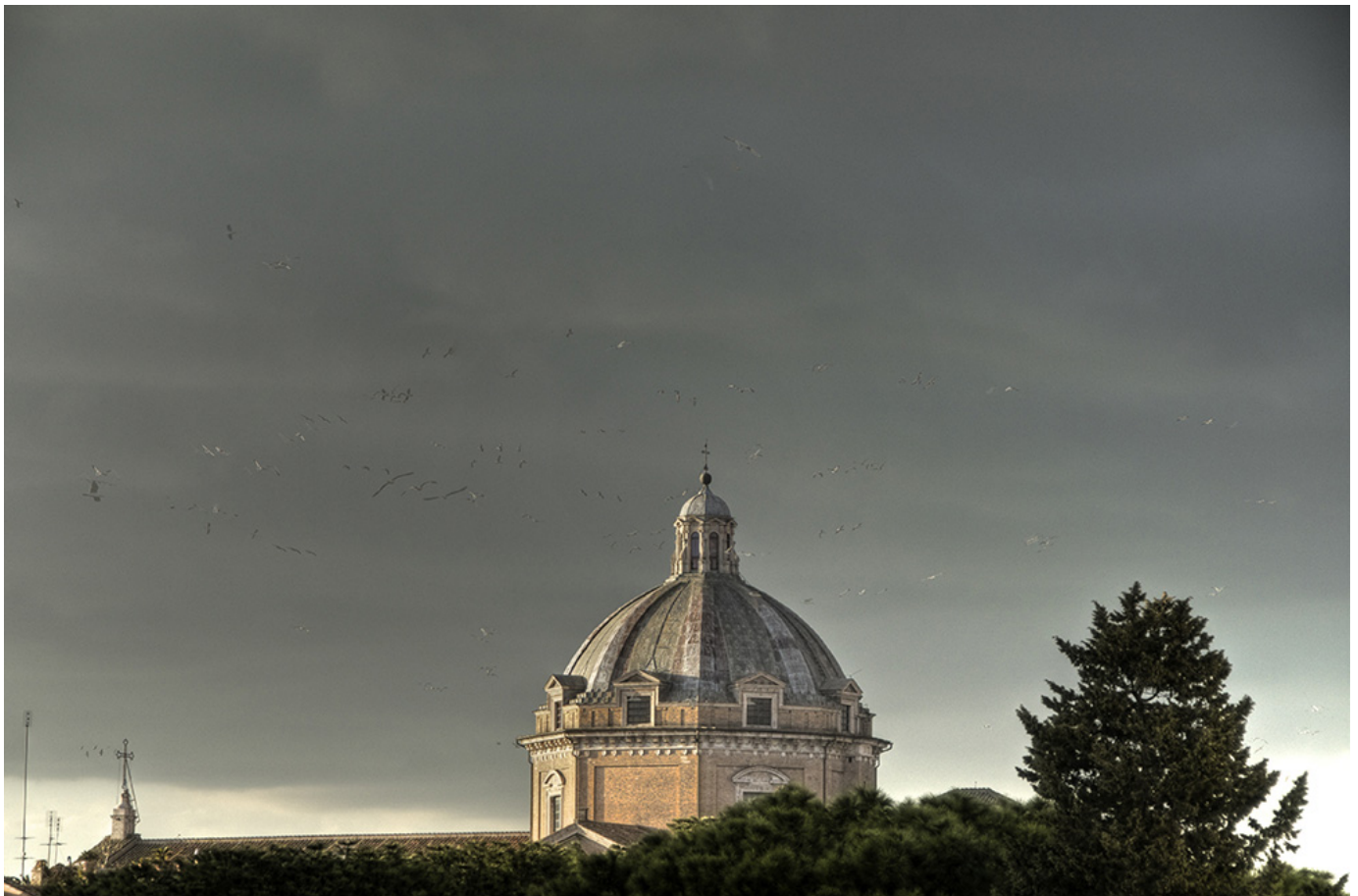
The dome of the Church of the Gesù, the mother church of the Society of Jesus in Rome