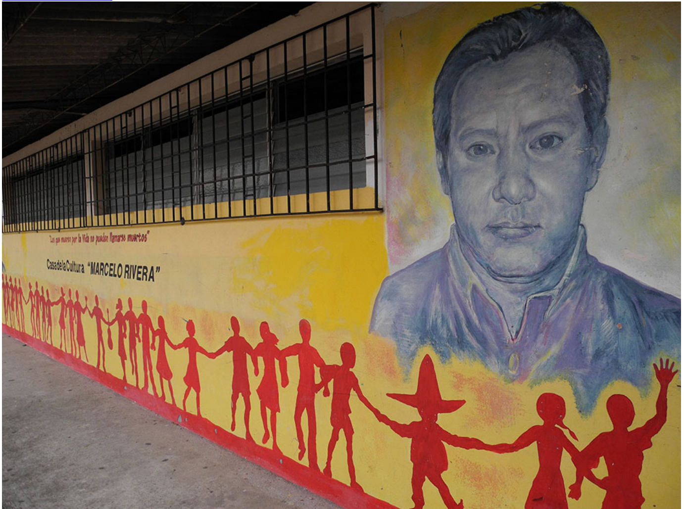
A mural of the late water defender Marcelo Rivera on the Casa de Cultura in San Isidro, Cabañas, El Salvador