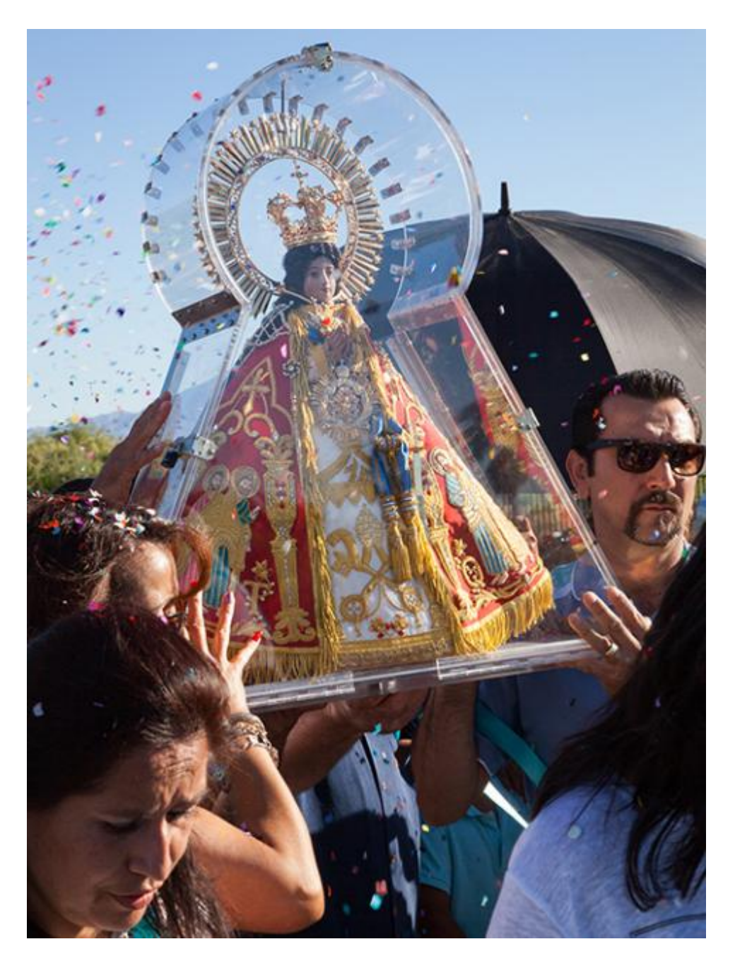
Photo from Noé Montes, an artist who comes from a family of migrant farmworkers, taken in Mecca, California, during an annual visit of La Virgen de Zapopan to the United States in 2015. (Courtesy of Noé Montes)

Rangel said that at the beginning of the pandemic many farmworkers were not given masks or their employers attempted to charge them for personal protective equipment. Others reported that workers were required to bring their own toilet paper to the fields.