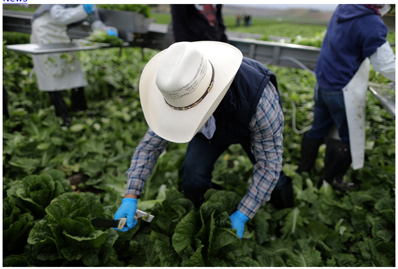
Migrant farmworkers harvest romaine lettuce April 17, 2017, in King City, California.