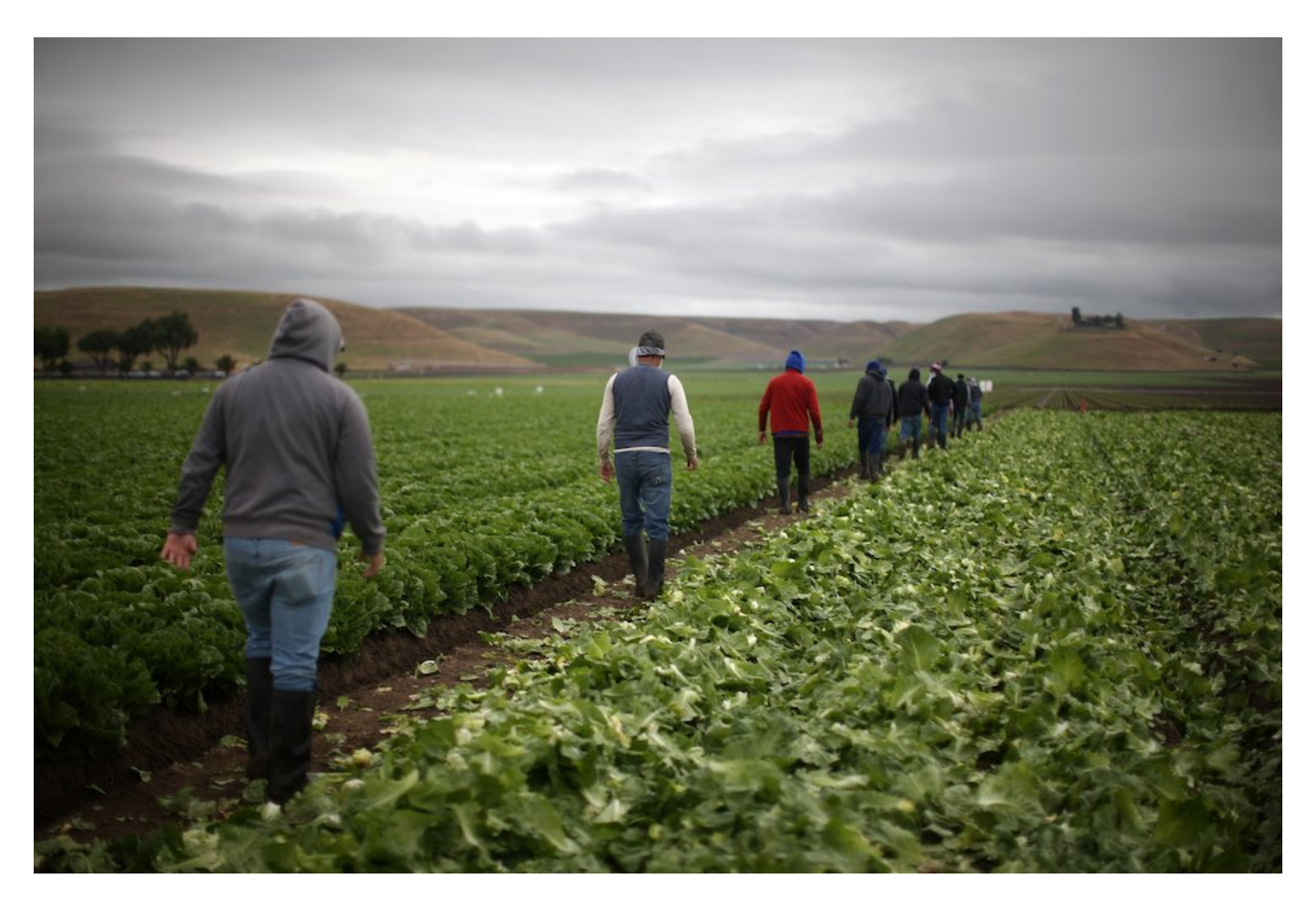
Migrant farmworkers with H-2A visas harvest romaine lettuce in King City, California, April 17, 2017.