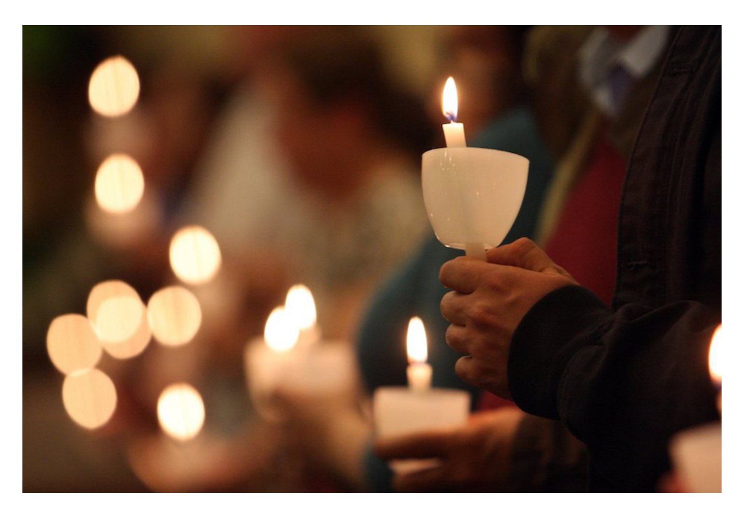
Pictured are worshippers holding candles in this 2012 photo.

On its face, this proposal may well seem laughable or even offensive. But isn't it better to expose as many wrongdoers, help as many victims and get as much truth revealed as possible? And isn't it best that this happen sooner than later?